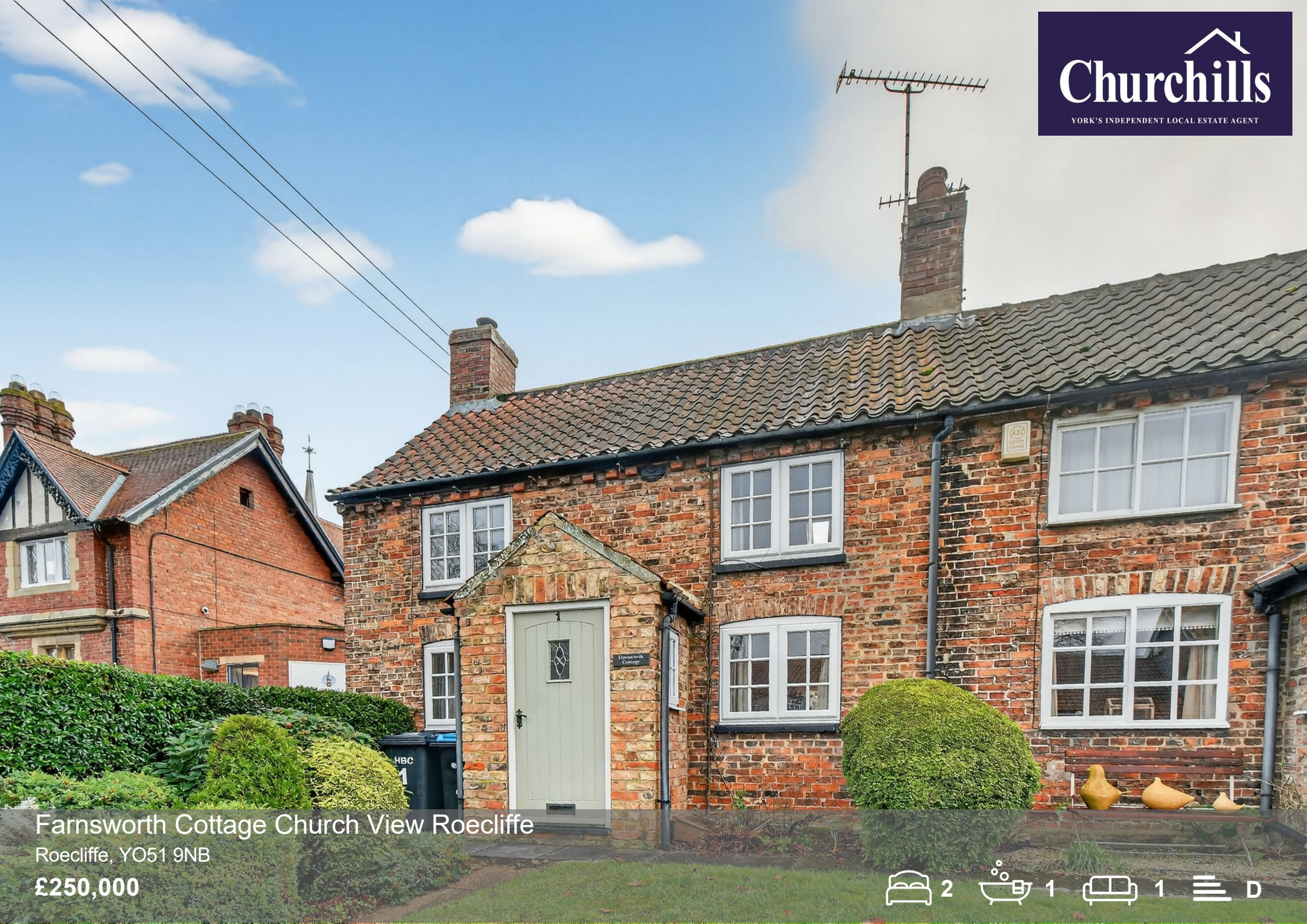
Farnsworth Cottage Church View Roecliffe Roecliffe, YO51 9NB £250,000